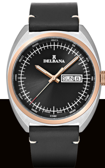
LOCARNO Quartz movement Two-tone rose gold IPG Case size 41.5mm / 11.6mm Water-resistant to 50m / 165ft 53601714.6.032