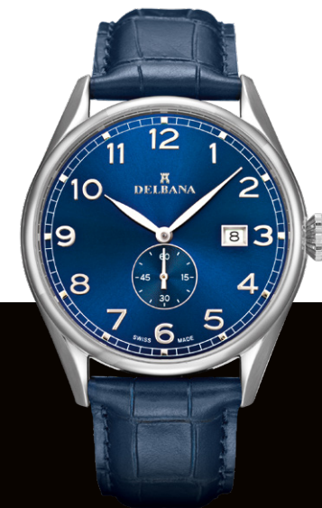
FIorentINO Quartz movement Stainless steel Case size 42mm / 9.5mm Water-resistant to 50m / 165ft 41601.682.6.042