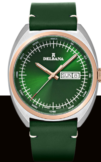
LOCARNO Quartz movement Two-tone rose gold IPG Case size 41.5mm / 11.6mm Water-resistant to 50m / 165ft 53601714.6.142