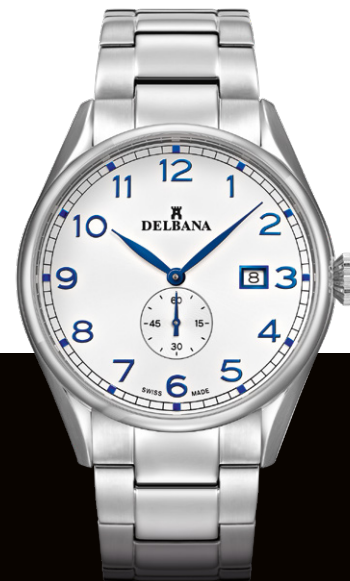
FIorentINO Quartz movement Stainless steel Case size 42mm / 9.5mm Water-resistant to 50m / 165ft 41701.682.6.062