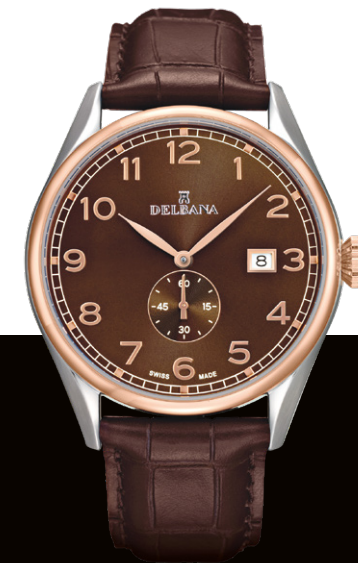
FIorentINO Quartz movement Two-tone rose gold IPG Case size 42mm / 9.5mm Water-resistant to 50m / 165ft 53601.682.6.102