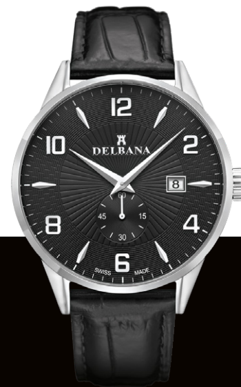
RETRO Quartz movement Stainless steel Case size 42mm / 10.8mm Water-resistant to 30m / 100ft 41601622.6.034