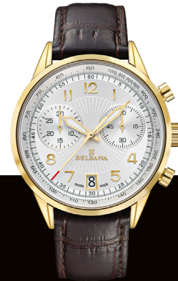
RETRO CHRONOGRAPH Quartz movement Stainless steel Case size 42mm / 12.3mm Water-resistant to 30m / 100ft 42601672.6.064