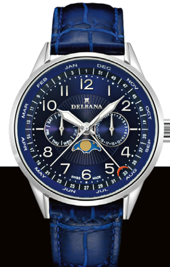
RETRO MOONPHASE Quartz movement Stainless steel Case size 42mm / 12.3mm Water-resistant to 30m / 100ft 41601646.6.044