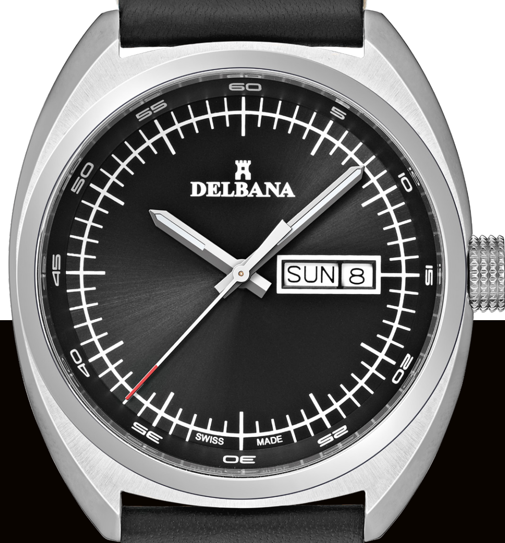
LOCARNO Quartz movement Stainless steel Case size 41.5mm / 11.6mm Water-resistant to 50m / 165ft 41601714.6.032