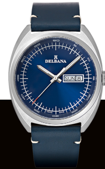
LOCARNO Quartz movement Stainless steel Case size 41.5mm / 11.6mm Water-resistant to 50m / 165ft 41601714.6.042