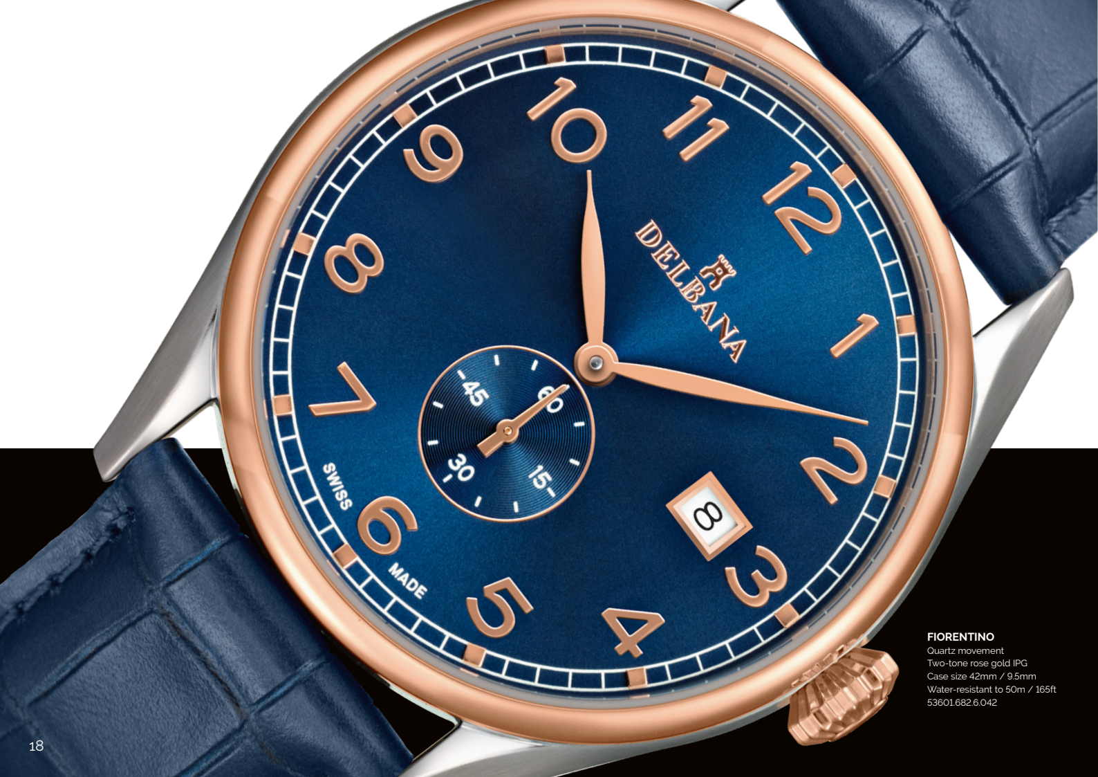
FIorentINO Quartz movement Two-tone rose gold IPG Case size 42mm / 9.5mm Water-resistant to 50m / 165ft 53601.682.6.042